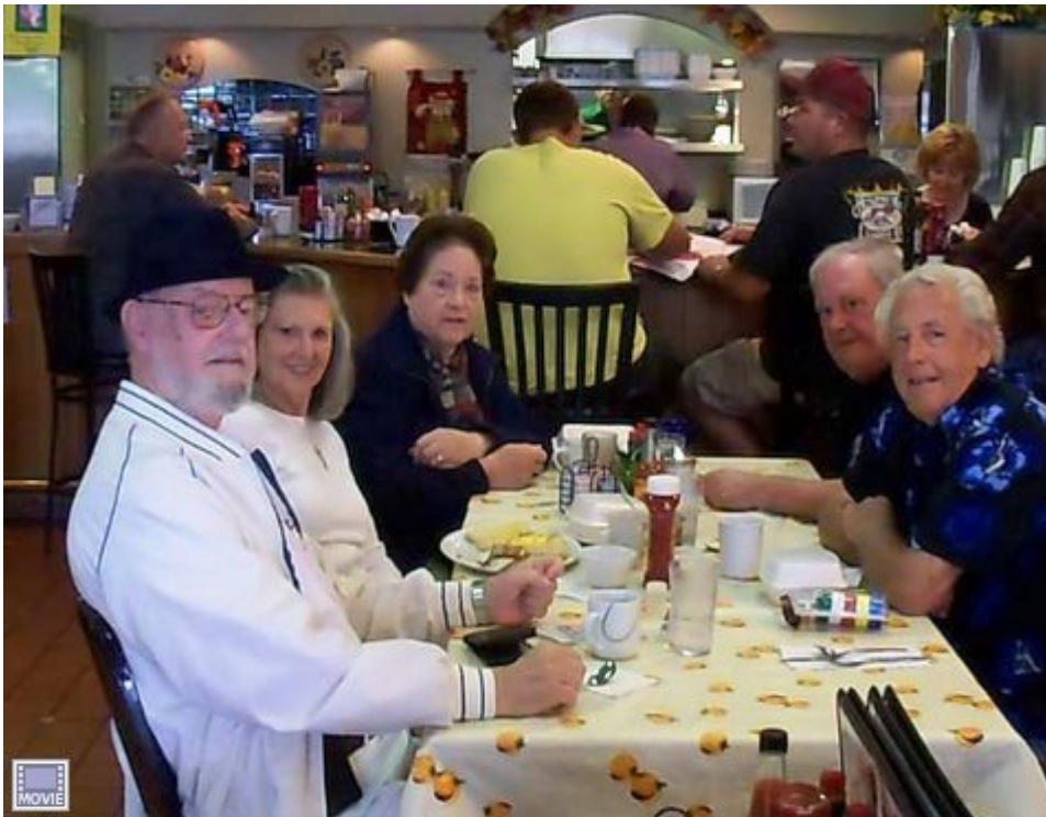
Some NorCal AMC Auto Group Members enjoying breakfast at Norm's Kitchen. They're there every Sunday at 9am. Stop on by! 478 Larkfield Center, Santa Rosa