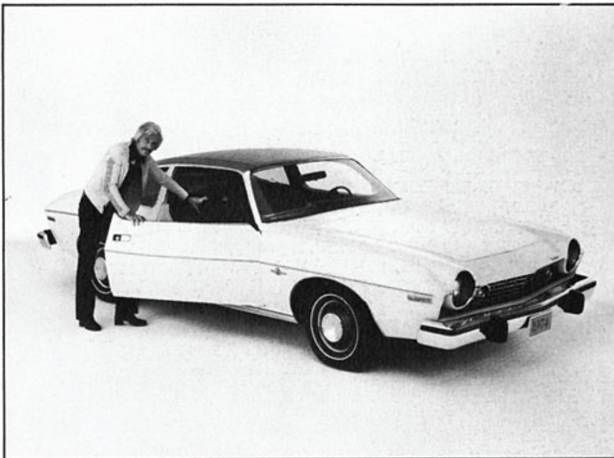
1974 CASSINI MATADOR —Oleg Cassini, noted fashion designer, created custom interiors for the 1974 Matador brougham. A choice of white, copper or black exteriors was offered, with accents of black and copper inside. Cassini model production for 1974 was 6,165; for 1975, 1,817.