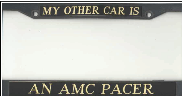
Nolan's most recent acquisition, a plate holder